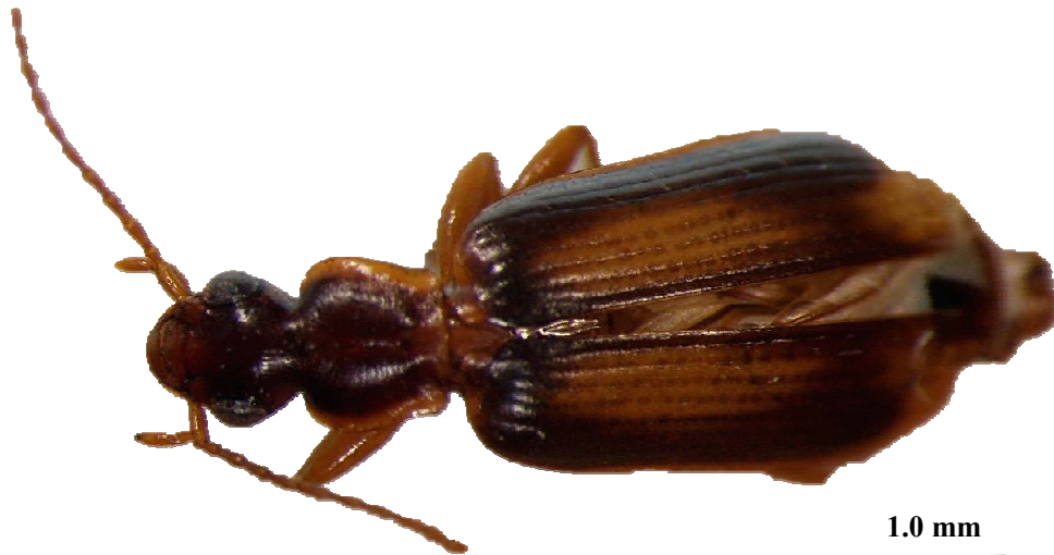
Fig. 2. Dorsal view of a male Dromius angustus alutaceus Wollaston, 1857